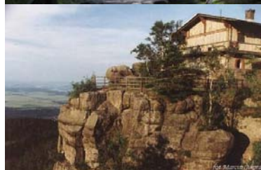
Wielki Szezeliniec, Poland A destination for this camp!

Join us for a chance to experience the beauties of Poland in a week of hikes, workshops and games!